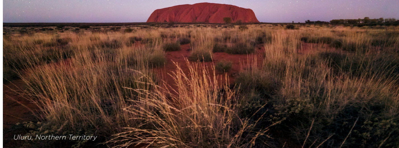
Uluru, Northern Territory

ABORIGINAL CULTURE & ASTOUNDING NATIONAL PARKS