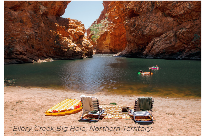
Ellery Creek Big Hole, Northern Territory