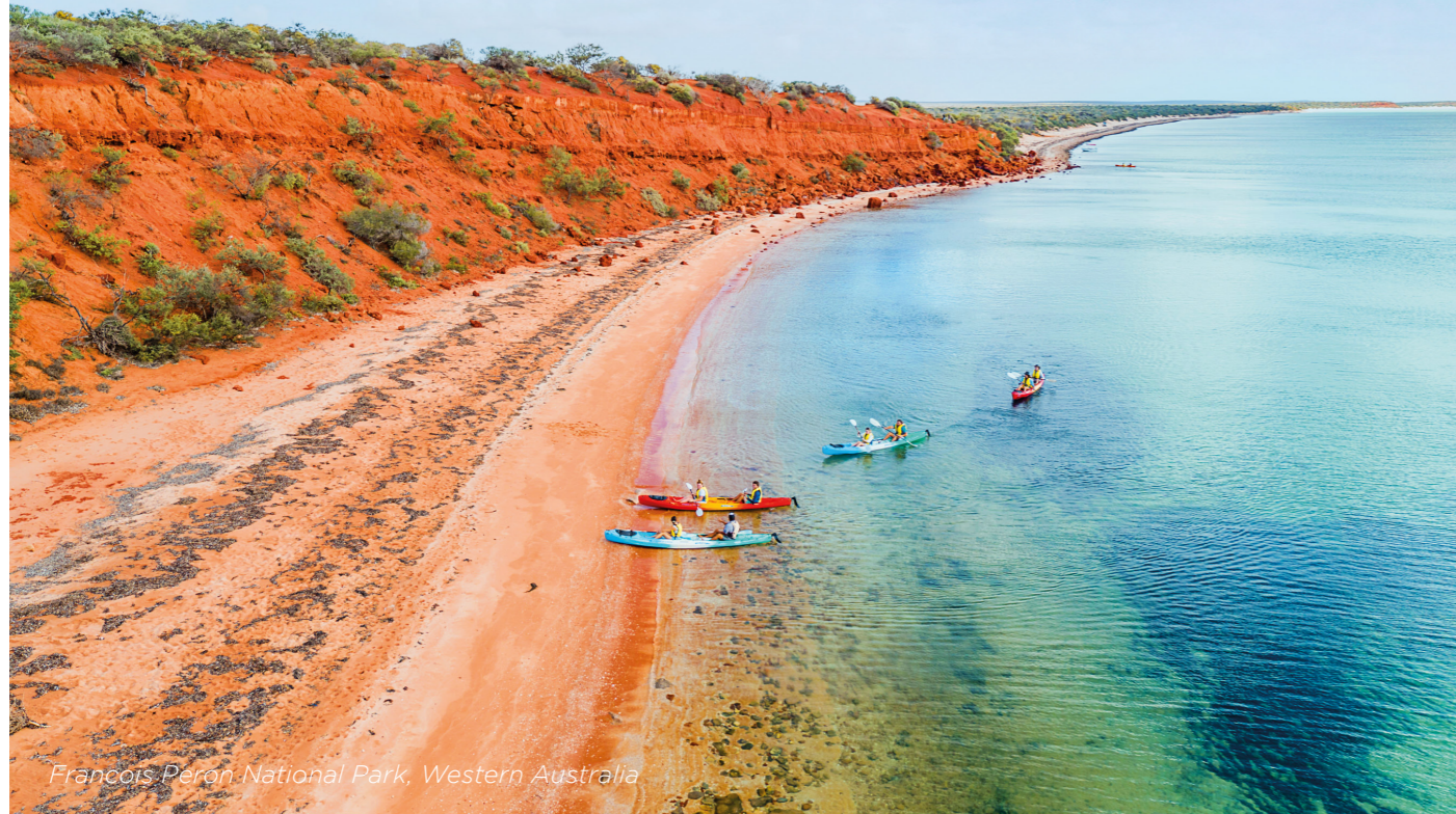
Francois Peron National Park, Western Australia

Immerse yourself in the rich cultural landscapes of Australia, where ancient traditions, storytelling, and deep connections to Country bring each destination to life. From the coastal beauty of Western Australia to the spiritual heart of the Northern Territory, these experiences invite you to walk alongside Aboriginal guides, uncover Dreaming stories, and gain a deeper understanding of the world's oldest living culture. It's a journey that goes beyond sightseeing—offering meaningful moments, powerful histories, and a genuine connection to the land and its people.