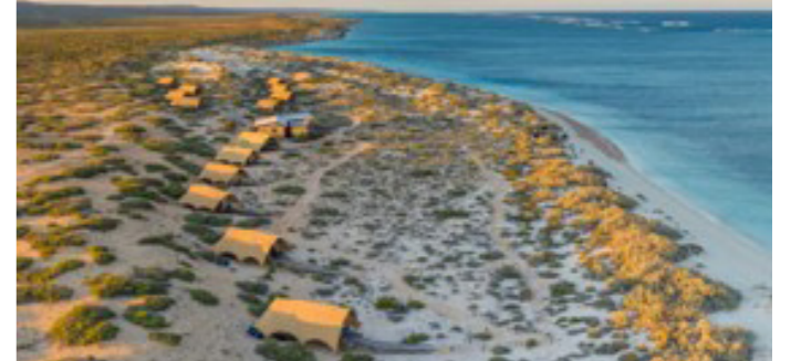
Sal Salis, Western Australia