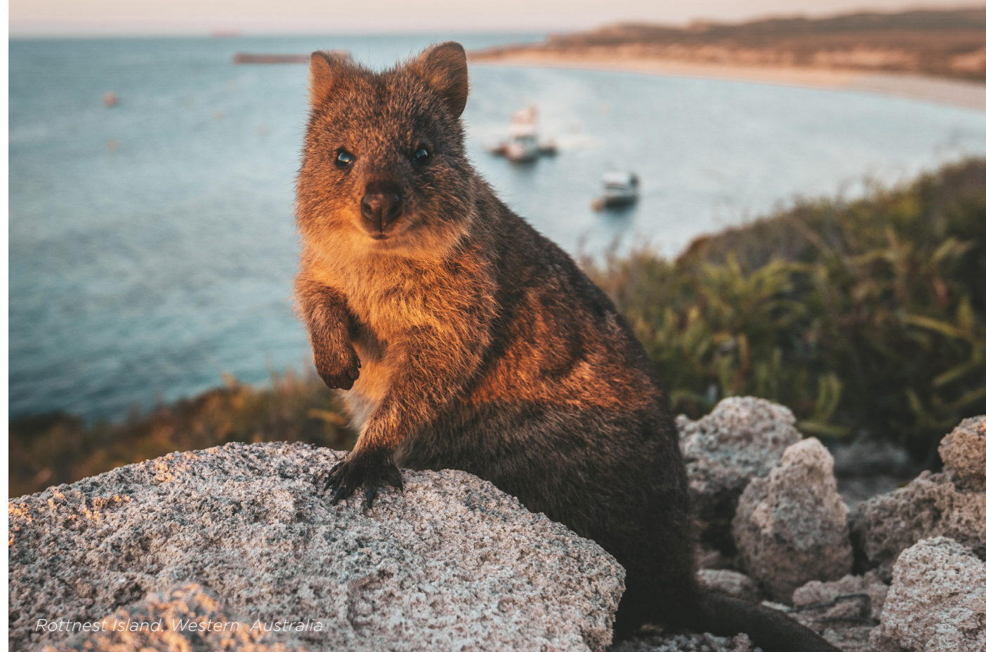
Rottnest Island, Western Australia

From island escapes and coastal adventures in Western Australia to sunrise journeys and wildlife-rich wetlands in the Northern Territory, these experiences showcase Australia's most iconic landscapes in unforgettable ways. Cycle turquoise shorelines on Rottnest Island, cruise along ancient Kimberley waters, ride camels across desert dunes at dawn, and glide through Kakadu's vast river systems teeming with birdlife and crocodiles. Each journey offers a different perspective of the Outback and coastline—blending adventure, wildlife, and awe-inspiring scenery into truly memorable encounters.