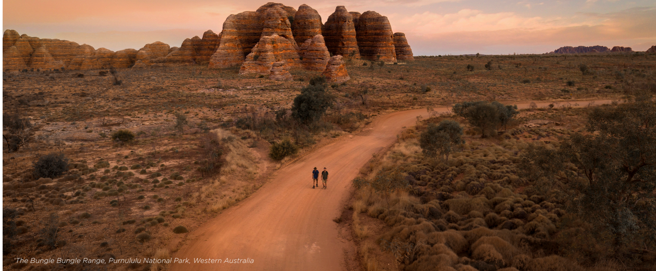
The Bungle Bungle Range, Purnululu National Park, Western Australia

Both Western Australia and the Northern Territory are synonymous with the outback and the ways to explore are numerous. This is Australia at its most dramatic, where the deep red of the desert sits beneath the bluest of skies. Dreamtime stories shape the people and the landscape and whether visitors are seeking a coastal or land based outback adventure there are many to enjoy.