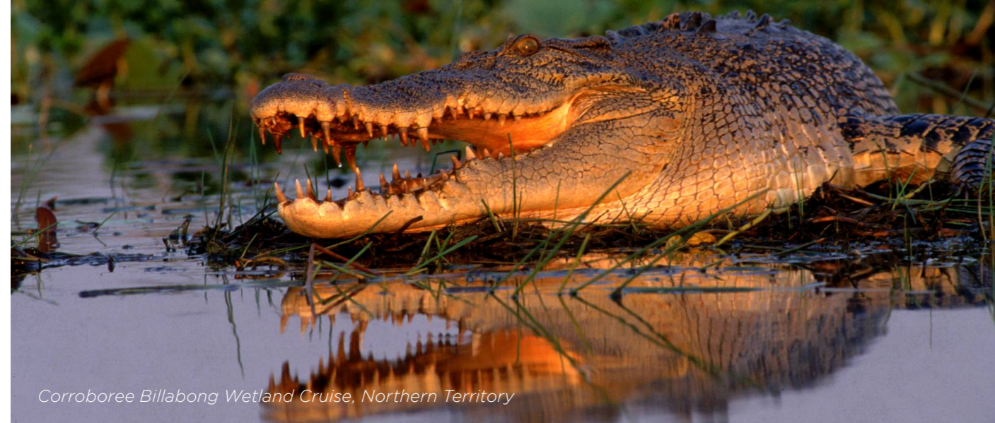
Corroboree Billabong Wetland Cruise, Northern Territory

From the turquoise waters of Western Australia to the rich red heart of the Outback and the wildlife-filled wetlands of the Top End, these Wildlife Wonders experiences showcase Australia at its most extraordinary. Paddle alongside marine life in pristine bays, swim with gentle ocean giants, uncover the secrets of desert-adapted species, and cruise through landscapes teeming with birds and crocodiles. Each experience offers a unique connection to nature, blending unforgettable wildlife encounters with the stories, environments, and cultures that make them truly special.