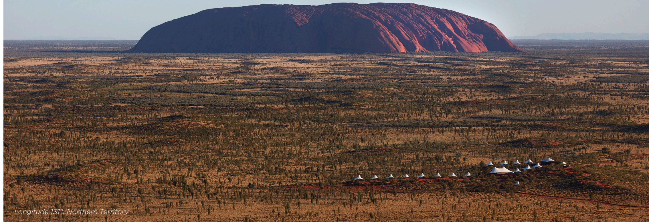
Longitude 131°, Northern Territory

Luxury in Western Australia and the Northern Territory takes many forms. But what defines luxury? Is it found in world-class hotels and fine dining, in the peace and solitude of a beachfront camp, or standing beneath the sandstone walls of a giant monolith watching as the sun sets, whilst everyone else leaves the park? Whatever your version of luxury is, you're sure to find it in Western Australia and the Northern Territory.